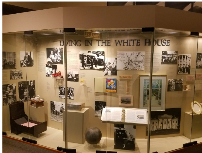
Figure 13: Living in the White House gallery

museum, they looked like one larger one. This exhibit would have been better served by combining it into one large gallery with a single narrative. This gallery aimed to provide context and provide a cause for the depression while the next exhibit examined the effects on Hoover.