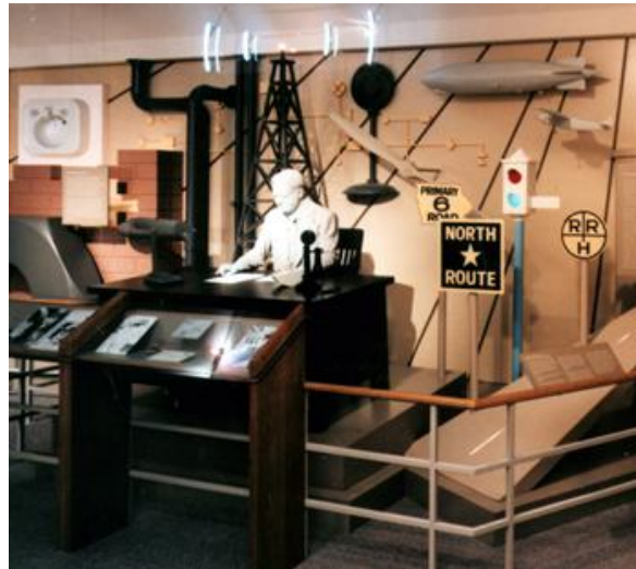
Figure 10: The Wonder Boy exhibit from the HHLP permanent gallery

With the end of WWI many people wondered what Hoover would do next. After aiding President Wilson during the end of the war Hoover's political identity remained unclear. Many thought him a Wilsonian Democrat after his support for the Versailles Treaty and the potential Democratic candidate for the presidency in 1920. Despite Hoover's popularity among the American people he was far from desirable for many among the two major political parties. With a short-lived contemplation for the presidential nomination in 1920, Hoover ultimately accepted an offer from President Warren Harding to serve as Secretary of Commerce.