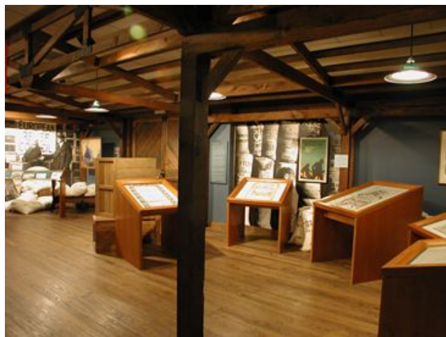
Figure 8: The Humanitarian Years gallery

and omissions reveal much about professionalism and patronage in the shaping of popular historical understanding.” 27 The maltreatment of Lou Henry only continued.