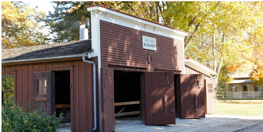
Figure 2: Jesse Hoover's recreated Blacksmith Shop

After the dedication of the park, the Birthplace Society turned their attention to the reconstruction of Jesse Hoover's Blacksmith Shop. Hoover, once again, had little direct influence on the project as most correspondences occurred between the Birthplace Society and Hoover's son, Allan, who acted as the lead consultant on the renovation. The reasons behind the reconstructed shop were never stated outright, but they were a part of the Birthplace Societies long-term plan drawn up in 1948. Construction on the shop was completed and the structure was dedicated in June 1957. 23