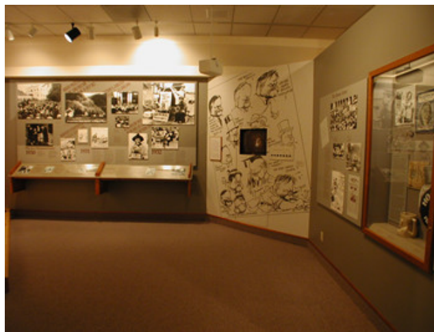
Figure 14: From Hero to Scapegoat Gallery

You can see it in the flat presentation within cases and on walls.” 48 This exhibit harkened back to George B. Goode’s early, cluttered Smithsonian displays. 49