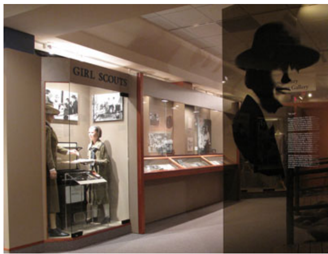
Figure 15: An Uncommon Woman Gallery

Clearly the museum could not decide what to do with Lou Henry throughout the entirety of the gallery. She popped in and out of exhibitions and was weaved into Hoover's narrative as a background character rather than a person with her own unique story. Understandably so as the museum served to tell Herbert Hoover's story; but the museum missed out on an opportunity to showcase Lou Henry in her own right. Despite this, the museum dedicated one its galleries in service of the First Lady; but unsurprisingly she became one dimensional.