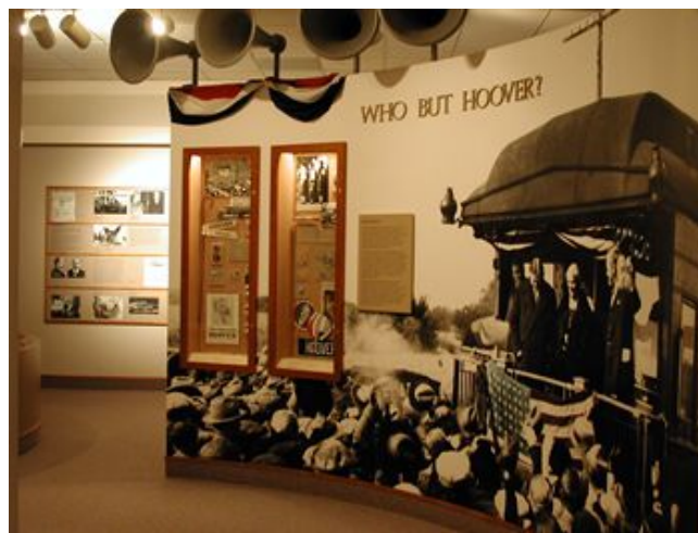
Figure 11: The Logical Candidate Gallery

“Who But Hoover?” the museum asked. The 1928 election arrived, and Hoover had garnered an incredibly favorable reputation not just within the US but around the world. Despite some opposition against Hoover’s “activist approach” within the Republican Party, he won the nomination and squared off against New York Governor Alfred E. Smith. Framed as East Versus West Branch, the gallery played on Hoover’s rural, small-town roots. Despite the Democrats’ attempt to paint Hoover as a radical, the people of the nation spoke, giving 58 percent of the vote to the former Secretary of Commerce. 37