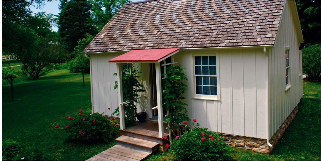
Figure 1: The Hoover Cottage as it stands today.

Jesse Hoover's Blacksmith Shop. The Birthplace Society did much of the planning for these new additions and Hoover mainly served in an advisory role approving the additions. 20