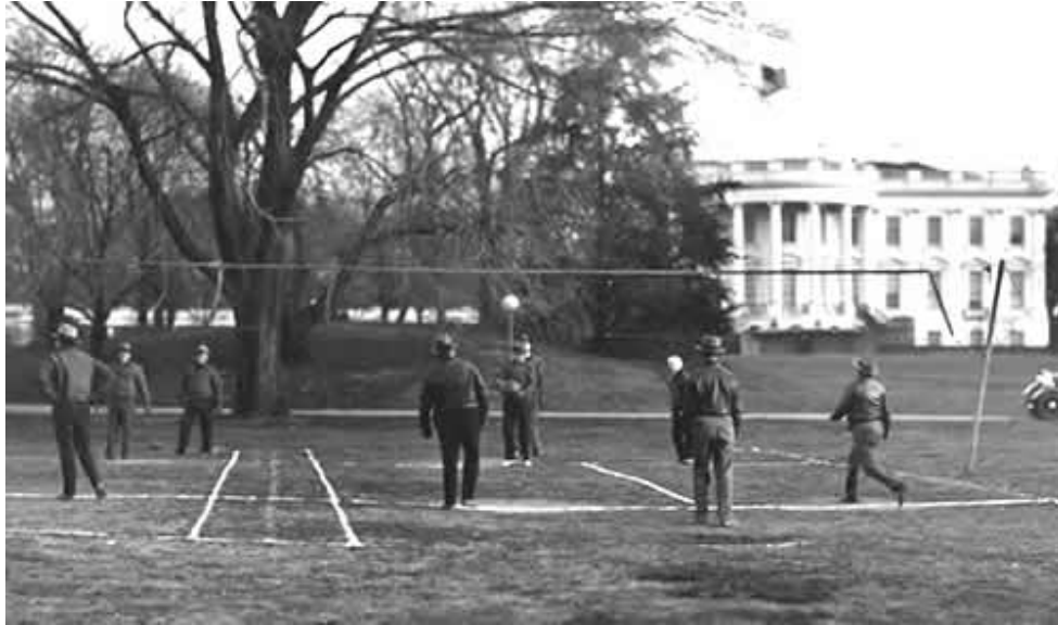
Figure 4: Hoover and the Medicine Ball Cabinet in 1933

White House that Hoover and the men he played with were dubbed the “Medicine Ball Cabinet.” 31