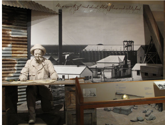
Figure 7: Years of Adventure Australia Exhibit

had many of the same faults as the previous 1970s exhibitions, but was ultimately an upgrade in terms of narrative and presentation.