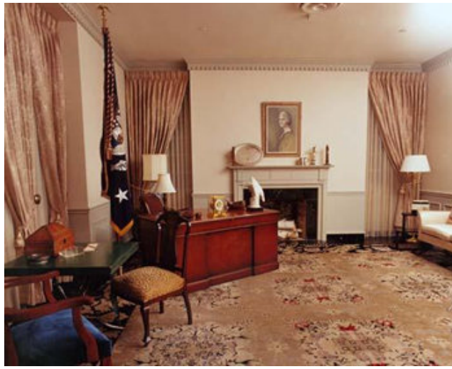
Figure 16: Counselor to the Republic Gallery

Lou Henry exhibit came as a byproduct of the era and sought to give context to her public life as historians of the decade reconsidered women's roles. The Lou Henry exhibition provided an opportunity to tell her story but raised the question: where was she in all the other exhibits? The nature of the Lou Henry exhibit indirectly emphasized that "women were everywhere secondary" despite the fact she was well-educated, well-traveled, and accomplished more than most men of her era. 56