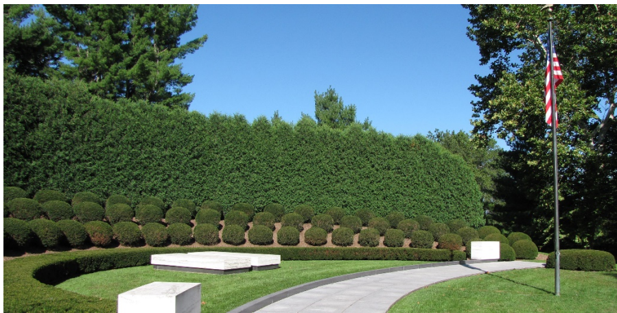
Figure 5: Herbert and Lou Henry Gravesites

flag. Beyond the waving flag, “on the horizon at the end of the two rows of trees, is a direct view of the white, wood-frame cottage where Herbert Hoover was born.” 44 Hoover was buried overlooking his childhood home, but beyond his home he overlooked the town of West Branch. The burial site returned Hoover to West Branch where he will remain.