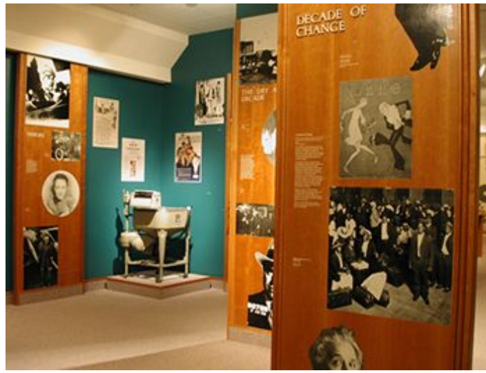
Figure 9: The Roaring Twenties gallery

The 1920s played a crucial part in the American story and the countries development. With new technologies and temptations abound, society changed drastically. Urban areas became the major population centers, prohibition and jazz were in, and technology changed the American lifestyle. The gallery portrayed “some of the enormous changes that took place in sports, literature, technology, communications, and other areas of American life during the 1920s.” 32 The gallery made almost no mention of Hoover which begged the question: why was this gallery included? The simple answer would be for context and the upbeat nature of the exhibit transitioned from the end of WWI to the beginning of Hoover’s time as Secretary of Commerce.