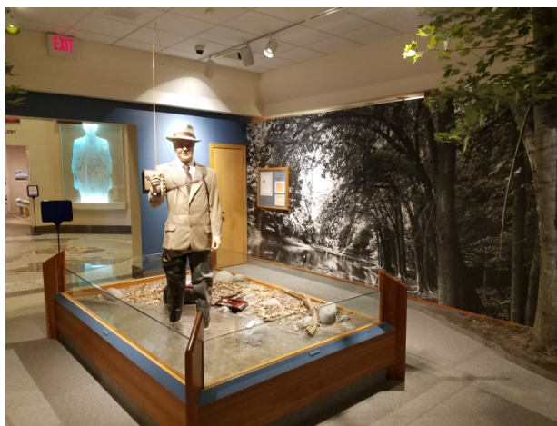
Figure 17: Herbert Hoover Fishing

Cluttered with a huge amount of material “Counselor to the Republic” suffered from lack of focus. The final exhibit covered almost thirty years of material in a single display, and the narrative faded away among all the pictures and labels. The Waldorf Tower façade to the overwhelming amount of material made this exhibit difficult to understand but the most glaring aspect remained the galleries ending. Rather than simply ending the gallery on Hoover’s redemption, the museum made a curious decision and ended the tour with a depiction of Hoover fly-fishing (figure 12).