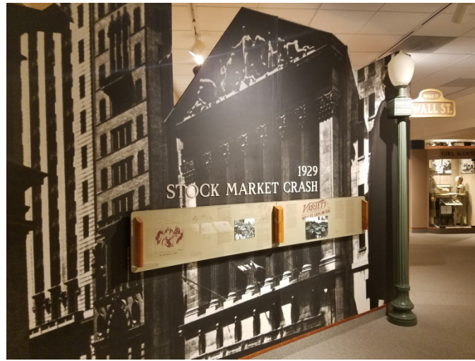
Figure 12: The Great Depression gallery (photo represents only a portion of the gallery)

“The Great Depression” was undoubtedly one of the most disappointing exhibits in the entire gallery. The worst economic crisis in the nation’s history “The Great Depression” gallery put the Great Depression in historical context and details Hoover's early responses to the crisis.” 40 The exhibit offered viewers little more than a glimpse into the start of the depression and shied away from addressing the elephant in the room. The Great Depression ruined Hoover’s legacy for decades and continues to plague public memory today. Instead of addressing the perception of Hoover during his presidency and how it was affected by the depression, the museum focused on economic principles and the debate among economists over what caused the depression. That debate remains about as unclear today as it did when the exhibit was planned and installed. However,